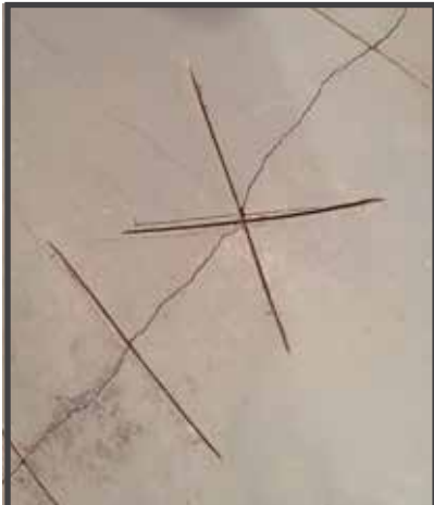
SINGLE BLADE WIDTH

The Concrete Crack Lock® is installed by making a single blade saw cut in the concrete across the crack and then drilling two small holes at each end. The cut is then filled with RCF High Strength Anchoring Epoxy Paste, and the Concrete Crack Lock® is inserted. The Concrete Crack Lock® requires less concrete removal and epoxy than other similar crack repair products, thus saving time on installation.