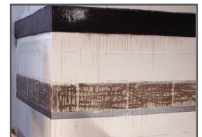
03: Repeat process to additional sections