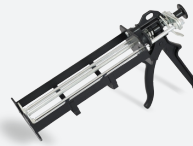
Rhino Carbon Fiber™ Dual Epoxy Gun 300/300 ml or 300/150 ml gun