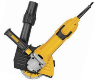
Use to tuckpoint joints of cracks **USE DIAMOND EDGE BLADE