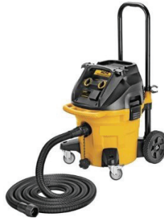
Collects dust while attached to grinder and shroud tools