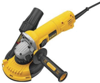
Use for grinding foundation wall **USE DIAMOND CUP WHEEL